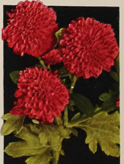
Chrysanthemum, Little Bob